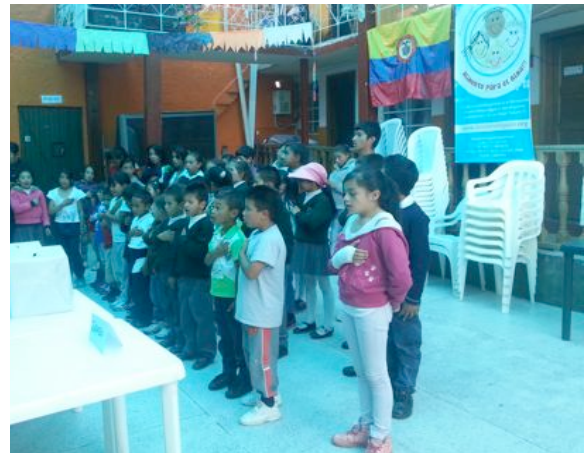
Our Future Leaders

I would like to take this opportunity to thank everyone that has been involved in one way or another in supporting this project. I hope you enjoy the Newsletter from now on and continue to be involved in this wonderful project.