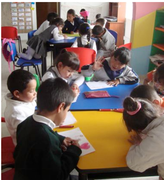
The Morning Circle

Professional in education and 100% in love with my work. With a million objectives to achieve I am happy to be working in the Círculos para ENprender project, because it makes me remember when I was in school, I start to think like a child and become enthusiastic about the small things in life. I can establish a direct contact with the children when I teach. I love to read them stories and look at their faces when they are waiting to find out what happens in the end. But my greatest joy is to find that it is they, who have fallen in love with reading books.